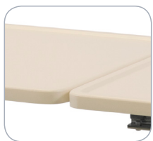
Recessed - Cream

is utilised to improve shipping and storage efficiency and reduce potential for damage