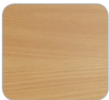
Laminate - Beech

is utilised to improve shipping and storage efficiency and reduce potential for damage