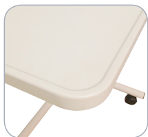
Recessed - Cream