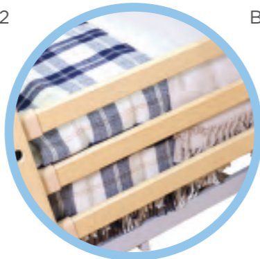
Side Rails - Beech BEA029865