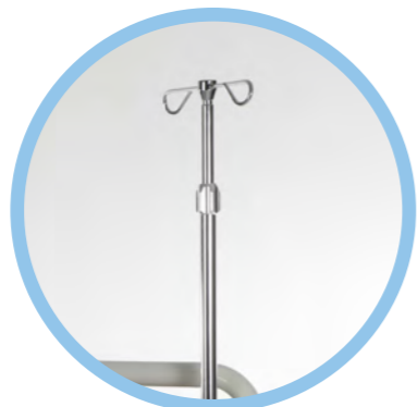
IV Pole BEA016592