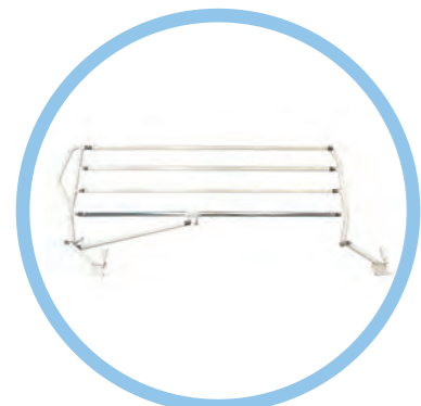
Folding Side Rails BEA016585