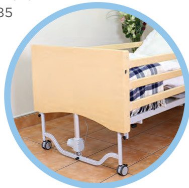
Shroud Ends - Beech BEA029845