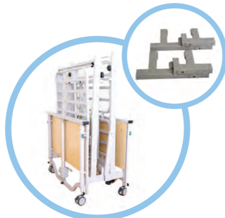
Transport Kit BEA029870