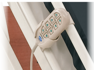
Water resistant hand control pendant