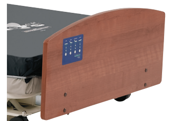
Range of head and footboards available.